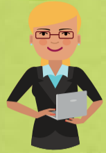
Planner to the T

Follow the Traits and try to guess which side of the road your friends are on. Maybe they are in the middle of the road?? (Make it a competition by betting points on your answers.)